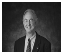
President's message, December 2009

This year brought many changes to the profession of architecture, and there is not a firm or practitioner in North Carolina whose life has not been altered by the economic events of 2009. We have all seen collegial ties shattered as architects lost staff in anticipation of – or as a result of - lost revenue. Some firms postponed the hard decisions at their financial peril, while others reduced salaries and hours in an attempt to hold valuable teams together. I can say that your Board of Architecture recognizes the difficulties experienced by the profession, and regularly discussed the impact of the Great Recession upon architects throughout 2009.