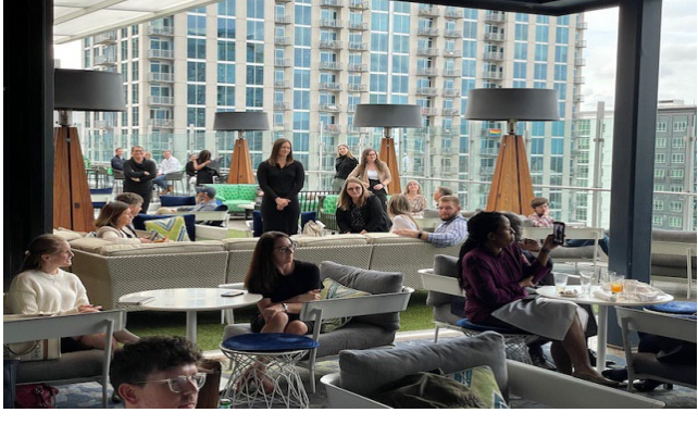
New Architects and Registered Interior Designers celebrate licensure and registration.